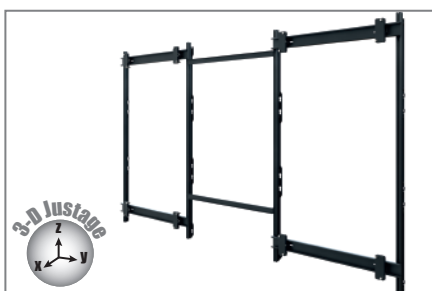
Fine adjustment possible on three axes